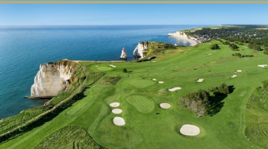
Étretat Golf Club

8-day cruises starting from $4,246 USD per person